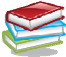
Evening Book Club Pg. 13