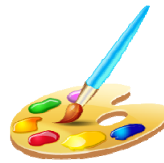
Arts Camp pg. 11