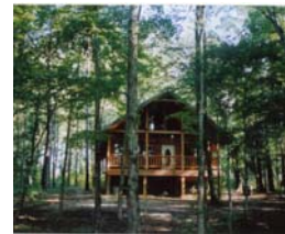
Men's Retreat Pg. 14